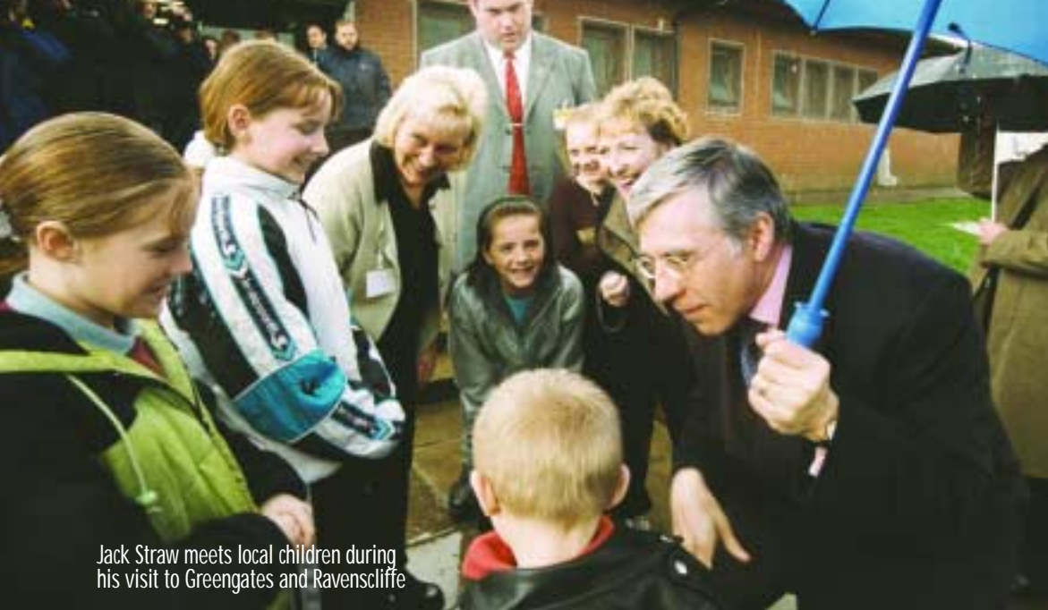
Jack Straw meets local children during his visit to Greengates and Ravenscliffe