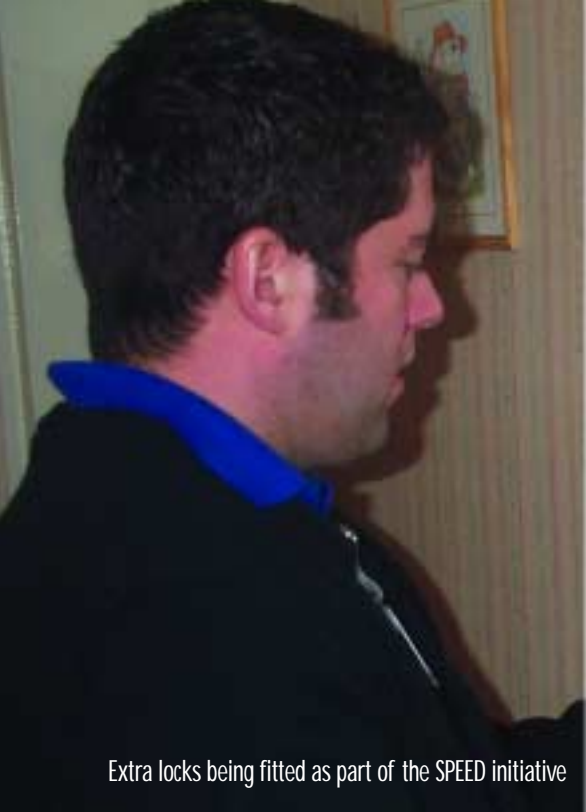
Extra locks being fitted as part of the SPEED initiative