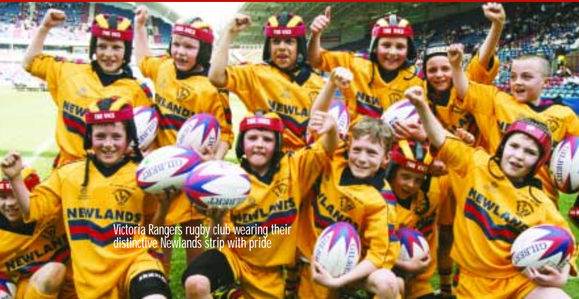
Victoria Rangers rugby club wearing their distinctive Newlands strip with pride

Keep reading on for more achievements from the key project areas >