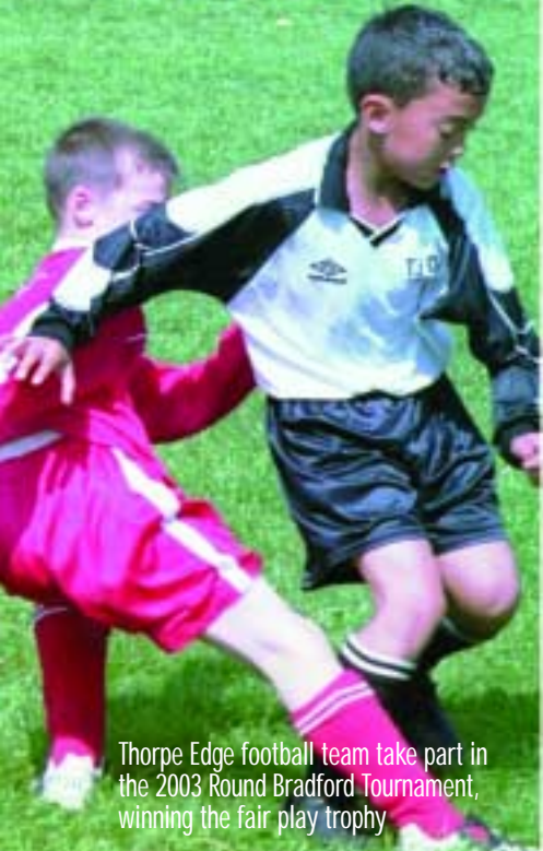
Thorpe Edge football team take part in the 2003 Round Bradford Tournament, winning the fair play trophy