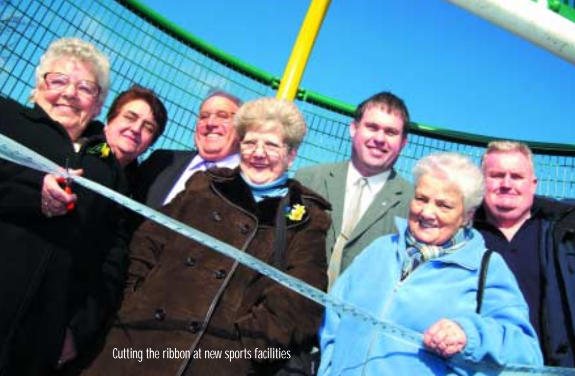
Cutting the ribbon at new sports facilities

// Newlands will produce an empowered, educated, skilled and healthy community, a refurbished and improved environment and a functioning local economy, in the five estates of Thorpe Edge, Ravenscliffe & Greengates, Fagley, Bradford Moor and Thornbury. //