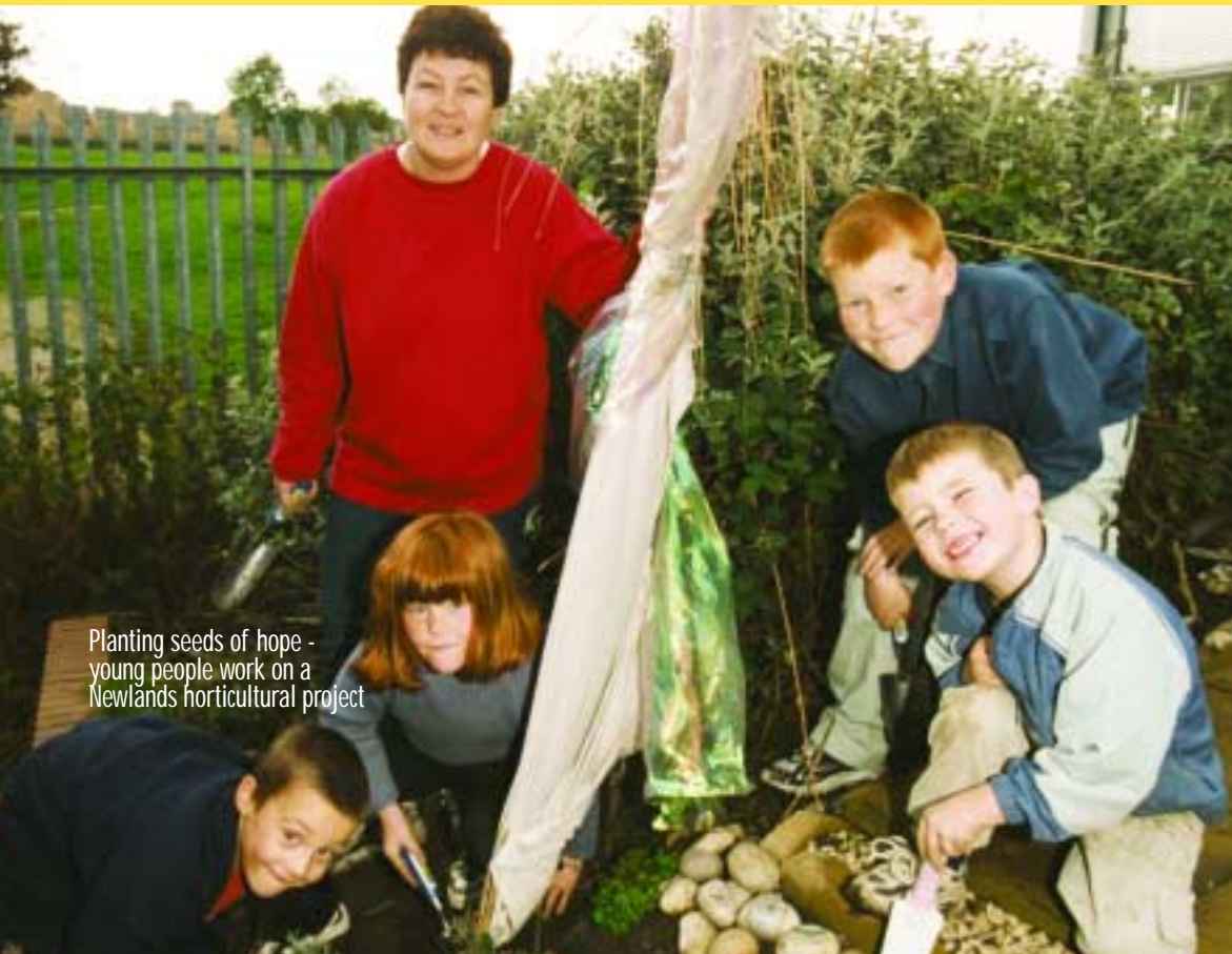
Planting seeds of hope - young people work on a Newlands horticultural project

None of this would have been possible without both SRB funding and an enormous amount of hard work and enthusiasm from members of the community, volunteers and the Newlands Partnership team.