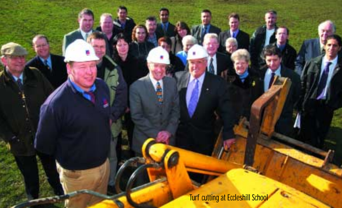
Turf cutting at Eccleshill School